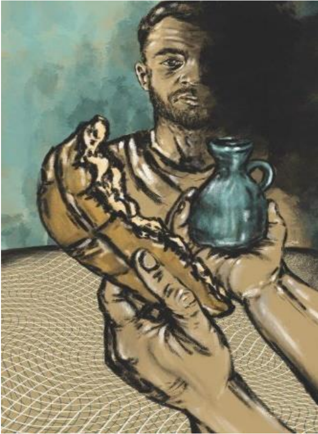
Remember by Lisle Wynn Garrity inspired by Luke 22:1-23